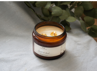
Breath of the Desert Candle