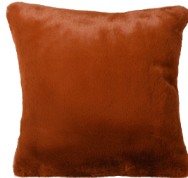
Burnt Orange Faux Fur Cushion Cover