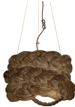
The Bride Pendant Light Brown

Blankets From Africa www.blanketsfromafrica.co.za